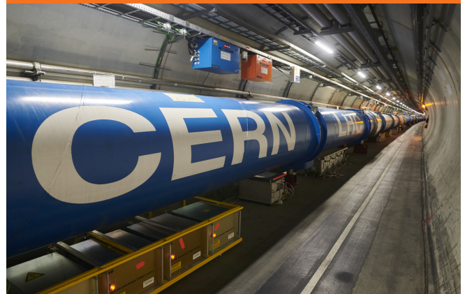
The Large Hadron Collider (LHC)