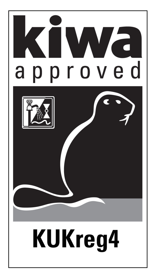
The KUKreg4 Certification Mark

Additionally, using the KUKreg4 Mark demonstrates that you have achieved independent third-party certification, providing your customers with confidence in your products and differentiating those products from market competitors.